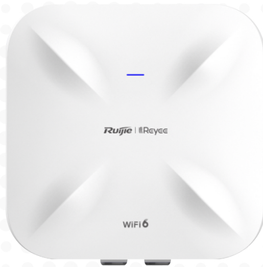
Figure 1-1 RG-RAP6260(G)